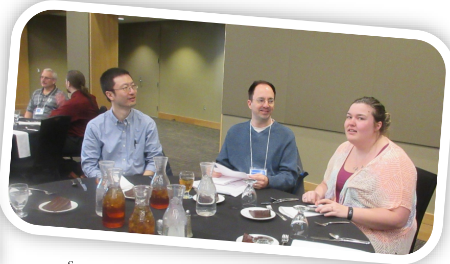
Some of the attendees from Emporia State University at lunch

More pictures can be found on the KSMAA website http://sections.maa.org/kansas/ .