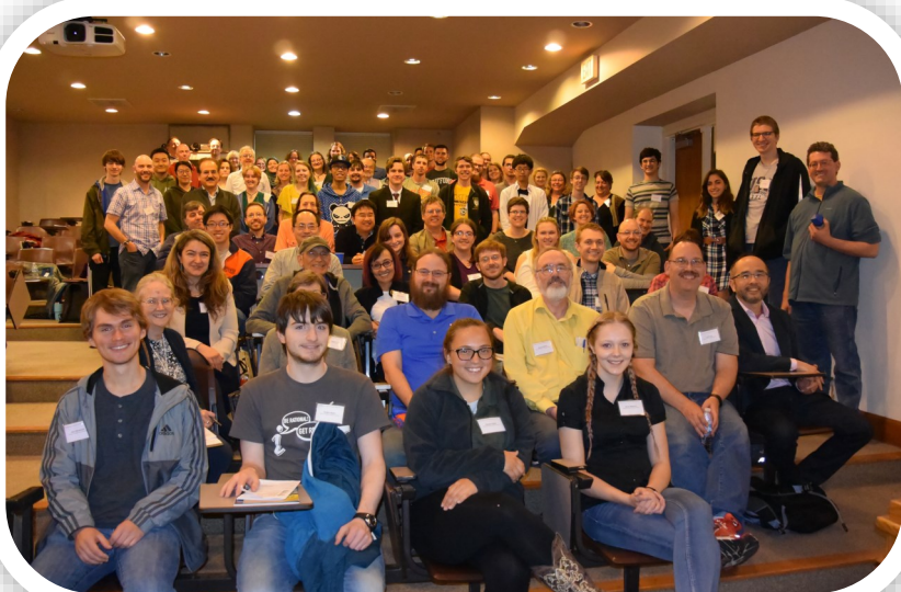
Group photo at KSMAA17